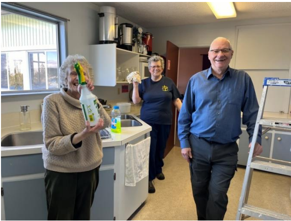
CLEANING BEE (cont'd)